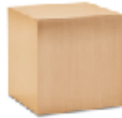
Traditional Bronze Cube $500 64 oz sheet bronze