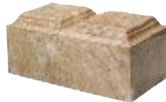
Classic Companion* $425 (8" x 15" x 6.25")