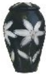
Crystal Lily $900 Hand-blown glass Memento $280