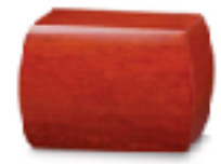
Tilia* $265 Wood veneer with cherry finish