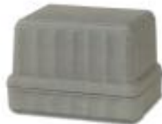
Universal $395 Gray or white