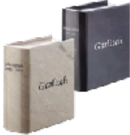
Marble Book Urn* $550 Cameo or Ebony