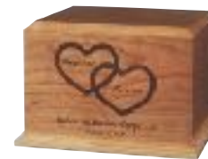
Companion Urn* $795 Cherry, Removable divider