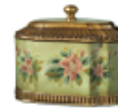
Green/Red Flora $340 Hand-painted resin cast from a handmade clay mold