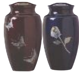
Purple Butterfly* or Blue Rose* Aluminum with inlay $275 Memento $90