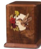
Hummingbird Walnut* $700