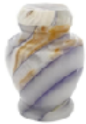
Onyx Blue Stone $625 Memento $210