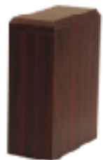
Basic Scattering $95