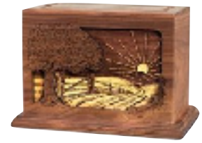
Country Roads 3D* $525 Memento $215