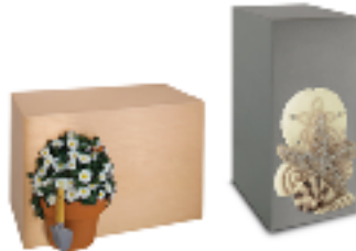
Bronze or Pewter Urn $590 Vertical or Horizontal emblems available