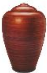
Barcelona $365 Biodegradable gelatin & sand