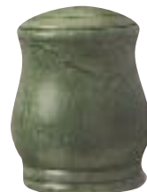
Alabaster Stone $395 Green or Brown Natural stone with properties of glass Memento $150