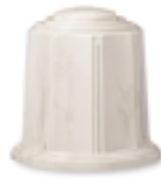
Regal * $295 Available in White/Silver, Cream/Gold or Pebble Dust