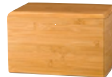
Barbados Bamboo* $240