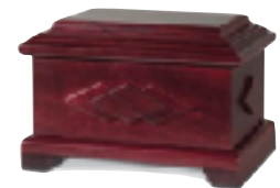
Victorian* $395 Solid Hardwood, rosewood finish *engraving on top only