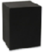
Basic Metal $150 Aluminum with black matte finish

All of these urns meet the requirements of Great Lakes National Cemetery 10" wide x 18" deep x 14" high