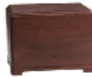
Hamilton* $320 Walnut with rosewood finish