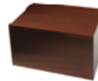
Basic Wood $125