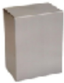
Pristine $195 Stainless Steel