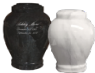
Embrace Urn* $395 Memento $135