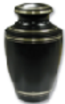
Black Elite Brass $245 Memento $75