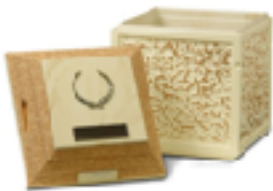
Cream and Gold Venetian with customization $850 Also available in Silver and White