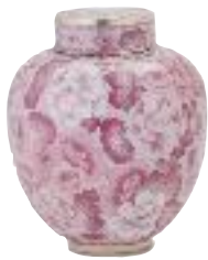
Cloisonne $495 (Rose or Blue) Memento $180