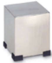
Argenta $495 Stainless Steel