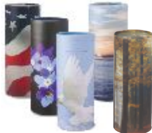
Scattering Tubes $165 12.5 high, Recyclable