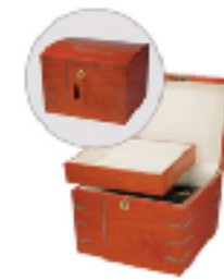
Sunrise Chest $395 Holds plastic container or Pristine SST