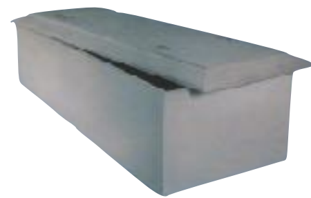
Concrete Grave Liner $750