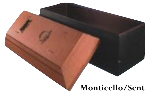
Monticello/Sentry Lined and Sealed Burial Vault $1450 High strength concrete construction Strentex inner liner Tongue-in-groove seal