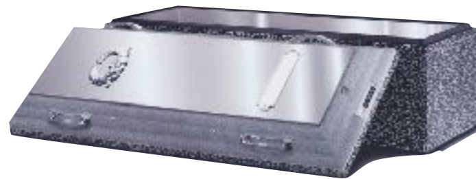
Stainless Steel Triune $2750 Extra heavy concrete construction Stainless steel interior metal liner Tongue-in-groove seal Special emblems and customized nameplate