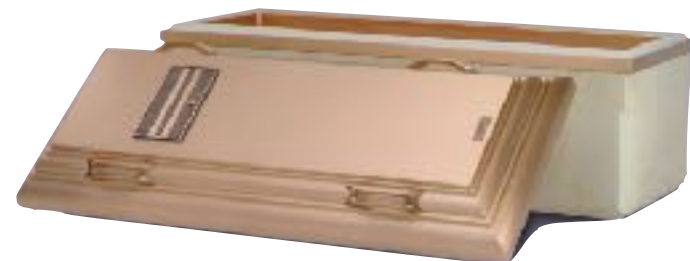
The Wilbert Bronze $13,000 Ultimate triple-reinforced protection Cover and base reinforced with durable bronze alloy Exterior base completely encased and reinforced with high impact plastic Memorialization Plus capsule (brass) and custom nameplate